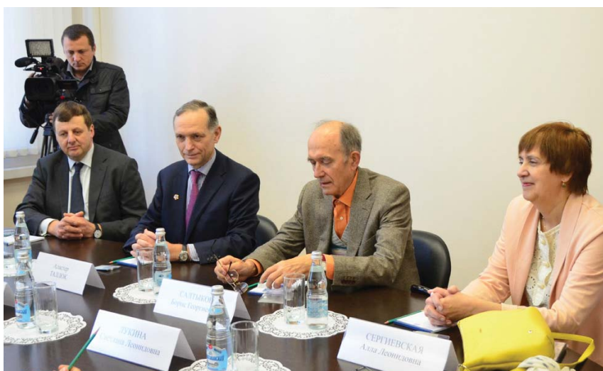
Members of the Oxford Russia Fund

In the long history of partnership, over 2,000 VSU students have been granted an Oxford Russia Fund Scholarship.