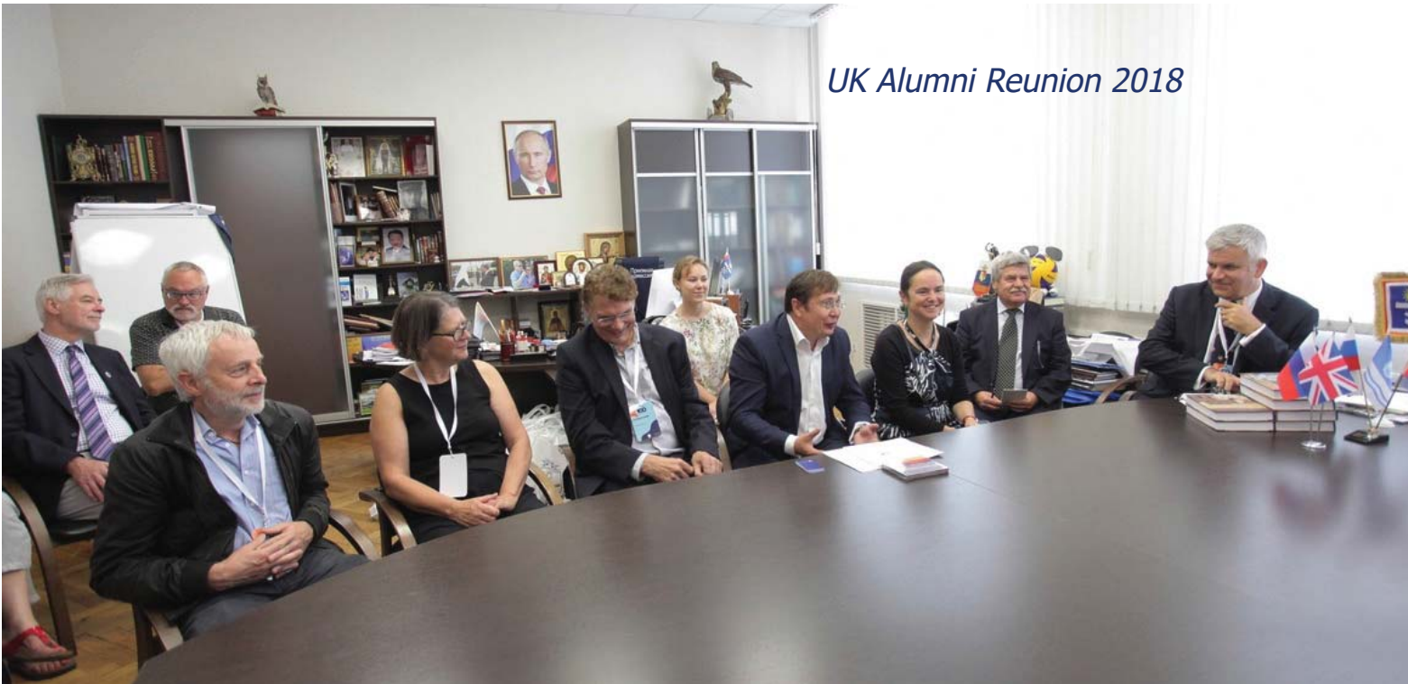
UK Alumni Reunion 2018

The British Alumni Group numbered over 20 at the VSU Centenary ceremony, some of whom had travelled to Voronezh for the first time in 40 years! See photographs of the alumni on Facebook page 'Voronezh State University British Alumni'.