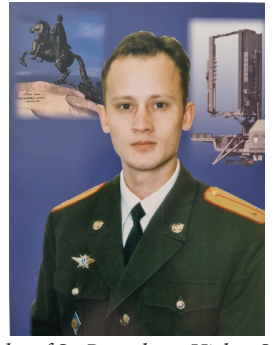
A cadet of St. Petersburg Higher School of Air Defense Radio Electronics. 2002

As a child, he wanted to be a pilot, but health problems forced him to give up his dream and he entered St. Petersburg Higher School of Air Defense Radio Electronics. After receiving education, my dad began to work outside his profession, because we had to move to another city.